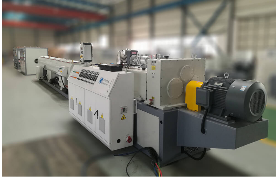
PVC PIPES MAKING MACHINE Cost Rs. 30,00,000/-