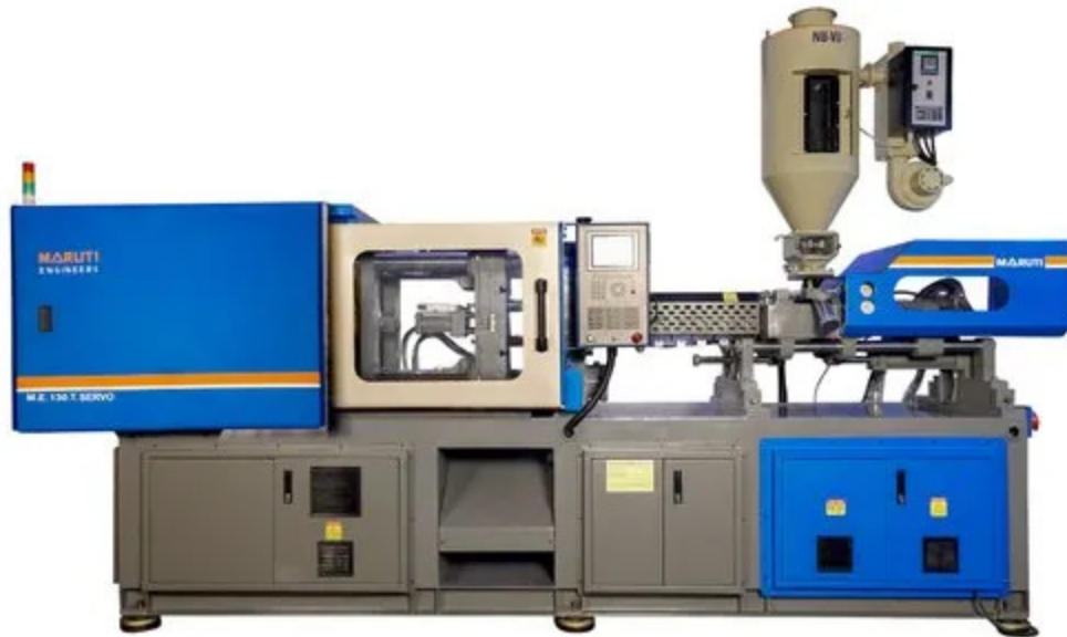
INJECTION MOULDING MACHINE Cost Rs. 17,00,000/-