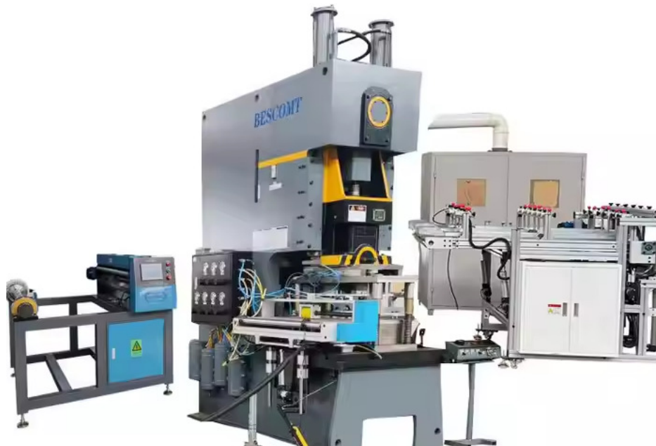
ALUMINIUM CONTAINER MAKING MACHINE Cost Rs. 14,50,000/-